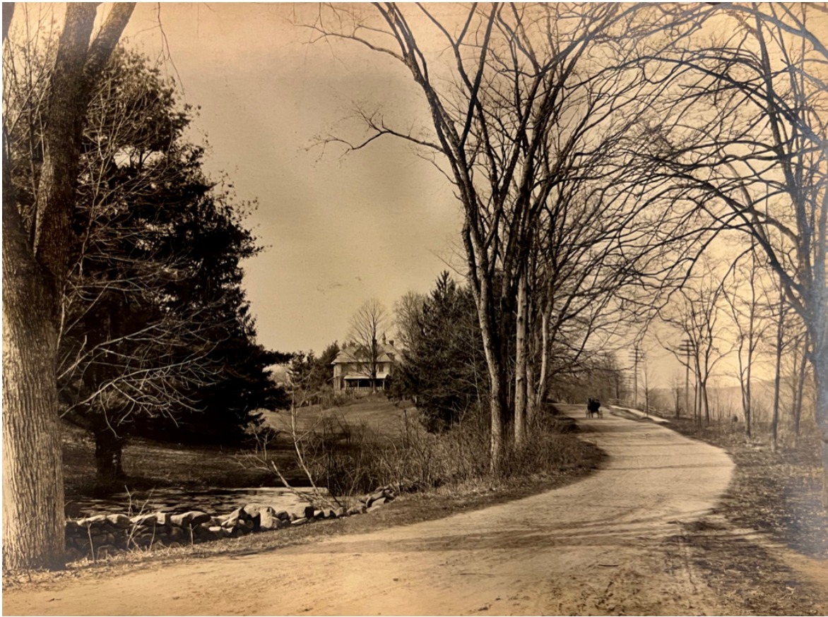
#7: View of Edgewood newer Farmstead from Forest Road, n.d.