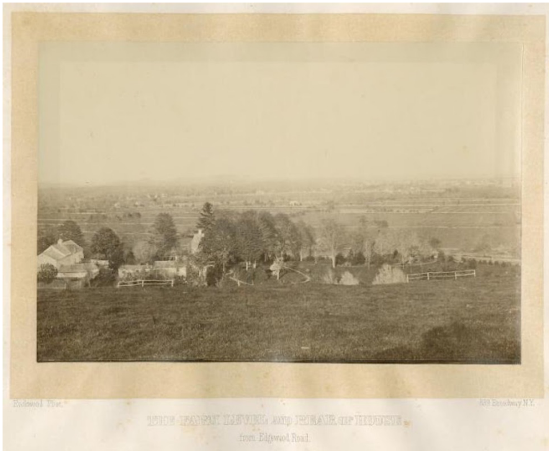
#8: View of Farm from hillside looking east toward harbor, c 1868