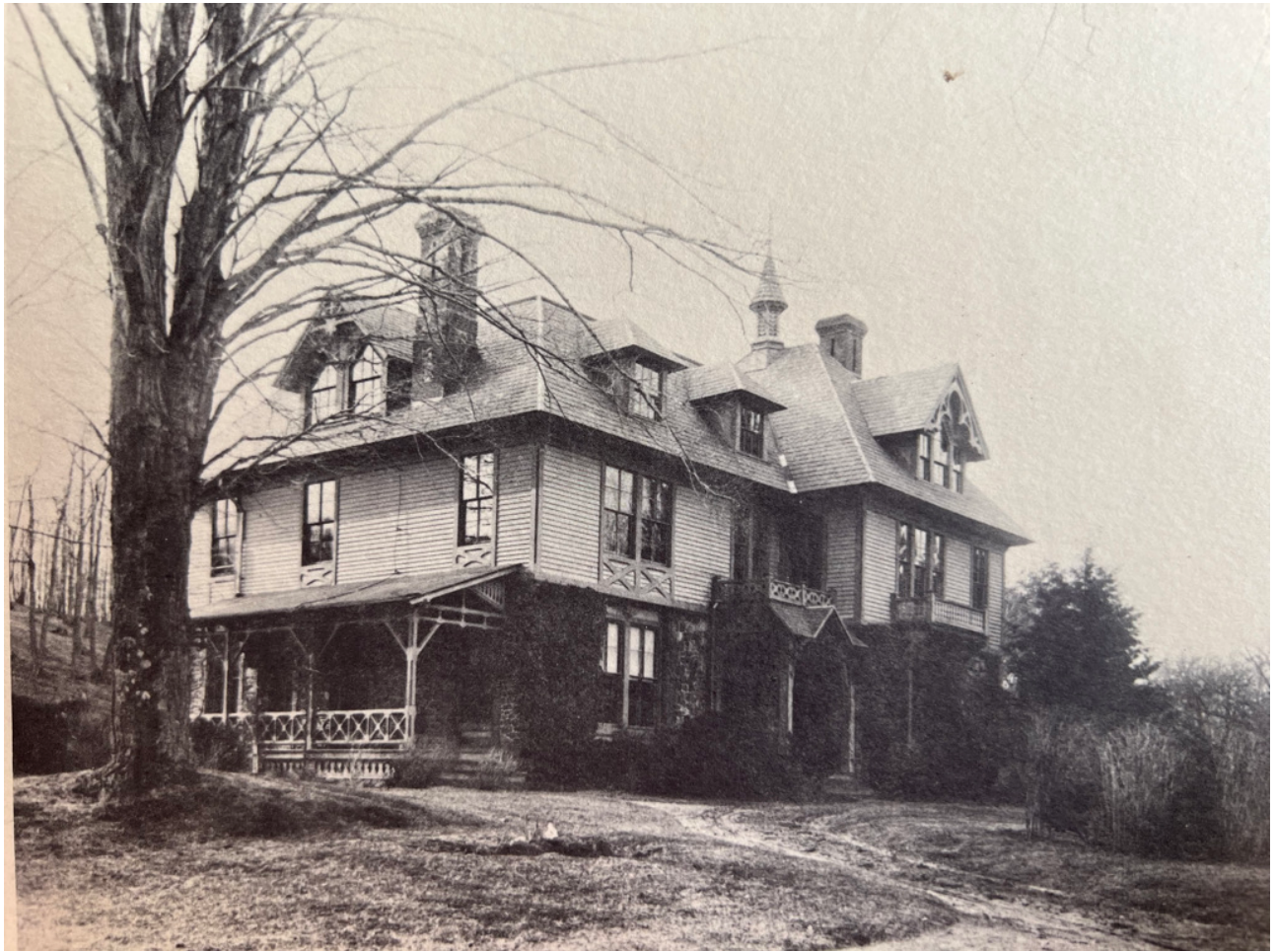
#3: Edgewood homestead, circa 1872