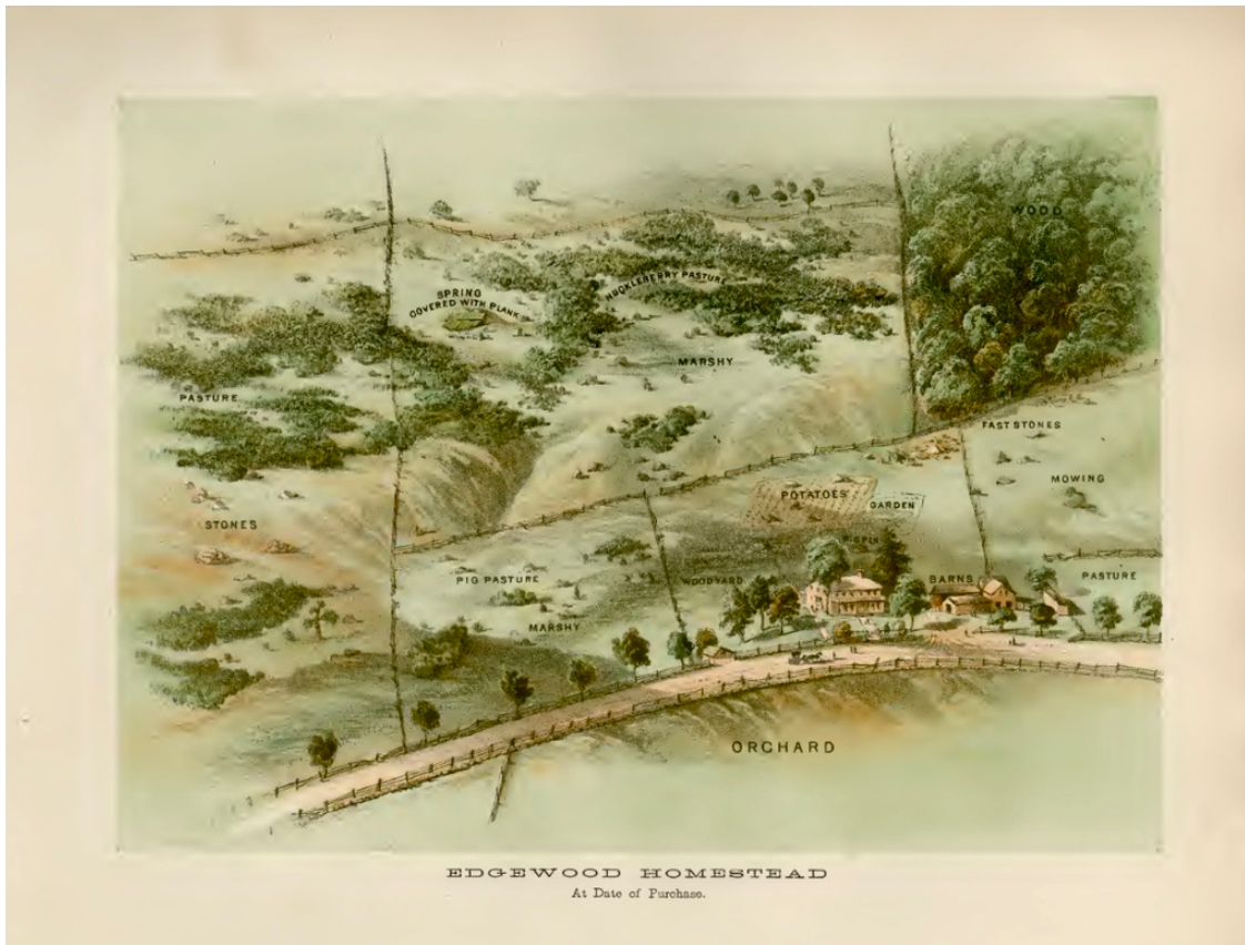
#1: Circa 1855