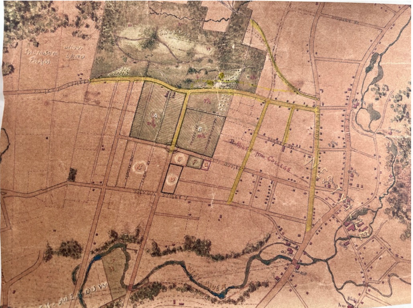
#9: Portion of DGM hand drawn map of New Haven/Westville and Edgewood Farm, c 1870