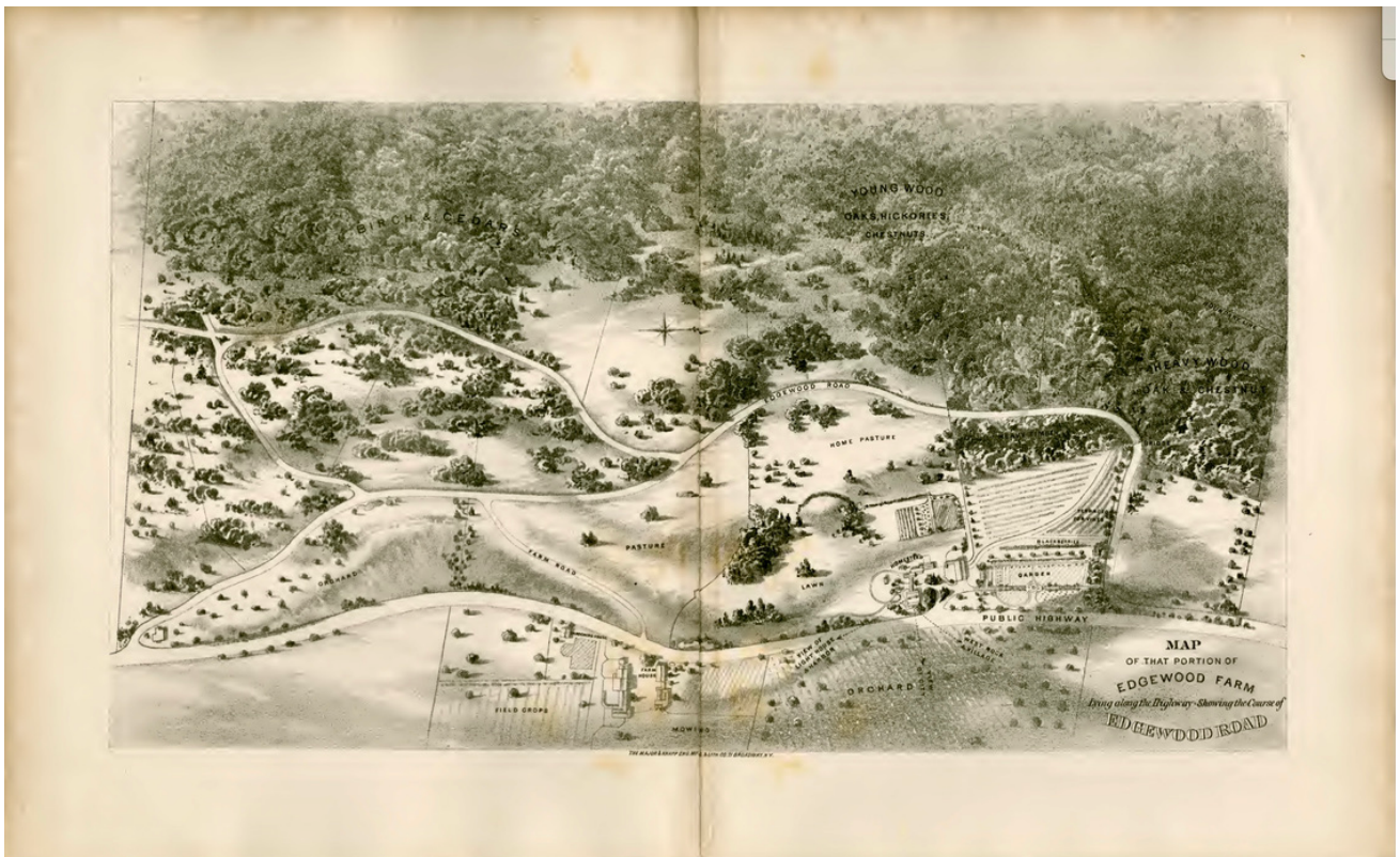
#4: circa 1868